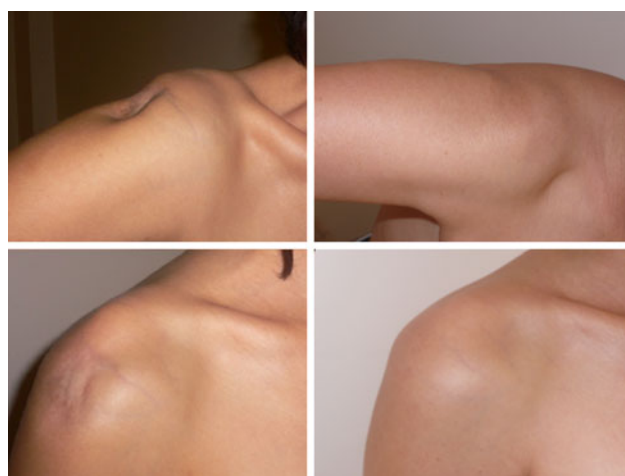
Fig. 4 Left Iatrogenic skin/soft tissue defect due to subcutaneous steroid injection treated with a single session of 8-cc SET injection. Subjective improvement in the skin quality was observed. Right 18 months after procedure