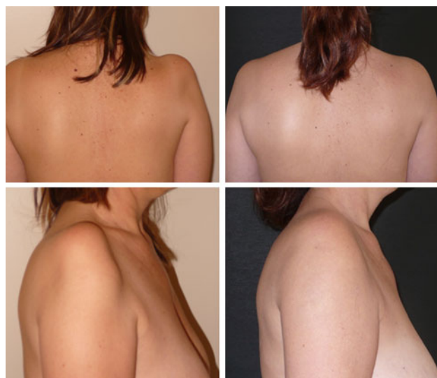
Fig. 3 Left Childhood polio sequel of the right shoulder. Right 18 months after single session of 180-cc SET injection

It can be speculated that previous attempts of fat transfers might have prepared the recipient bed and for this reason there was better take during subsequent SET